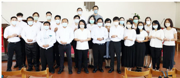
New Students dedication Service