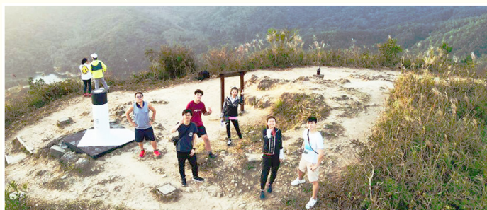
A Walk to Needle Hill