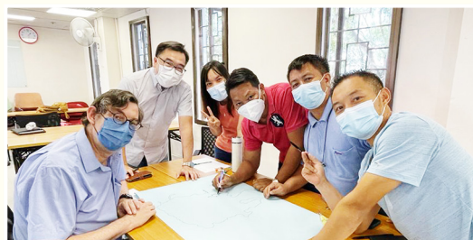
Students and Teachers fellowship