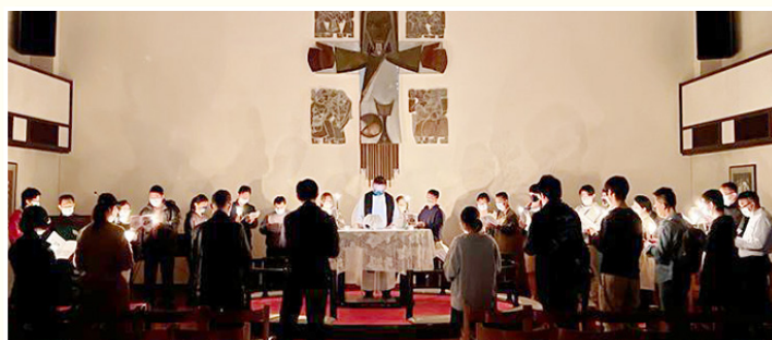
All Saints Eucharist